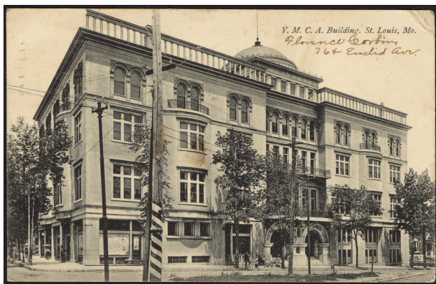
St. Louis Central Y.M.C.A. building from historic postcard

If so, the room he recalled was in this building.