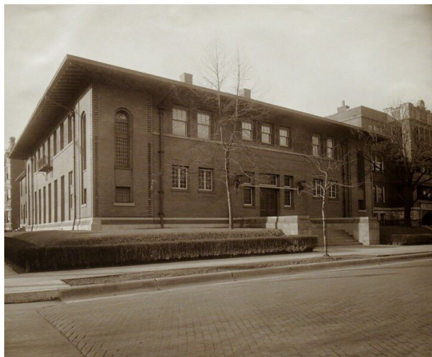
Westminster Place home of the Wednesday Club, 1908-1971